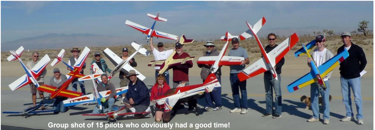
Group shot of 15 pilots who obviously had a good time!