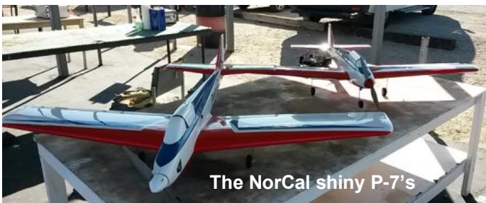
The NorCal shiny P-7's