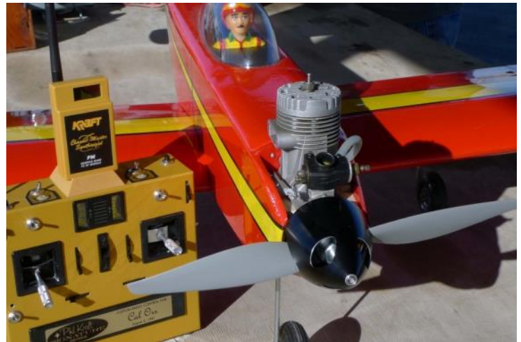
Above: Cal Orr's Kwik Fli; see article for more info!