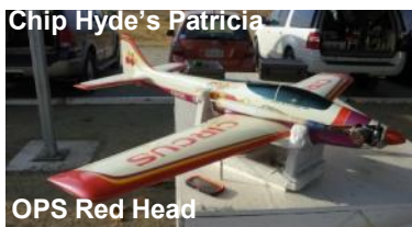
OPS Red Head