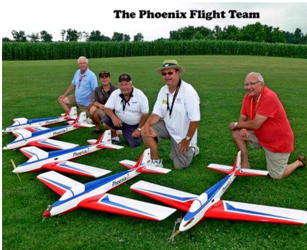
Five great looking Phoenix-7's, making up the Phoenix Flight Team.